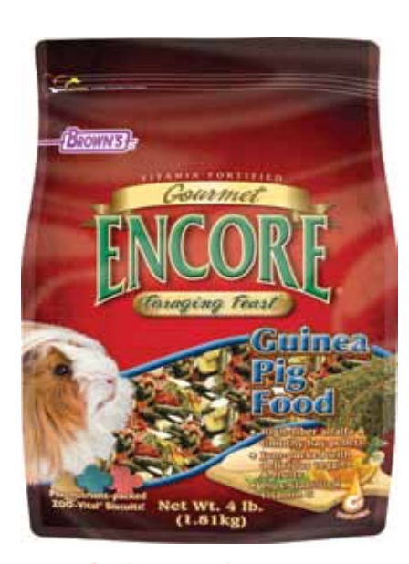
Guinea Pig Food