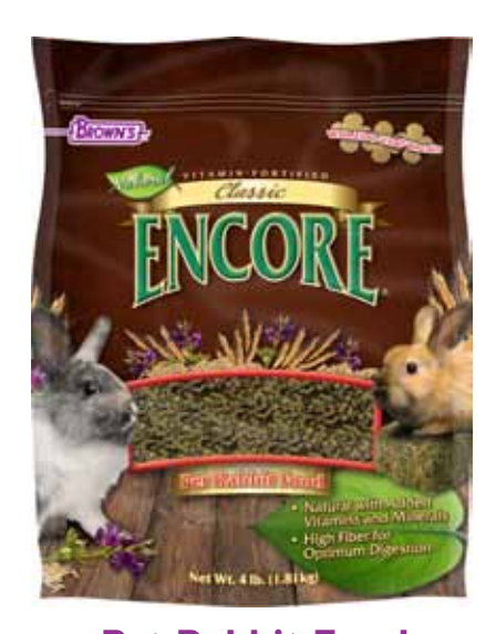
Pet Rabbit Food