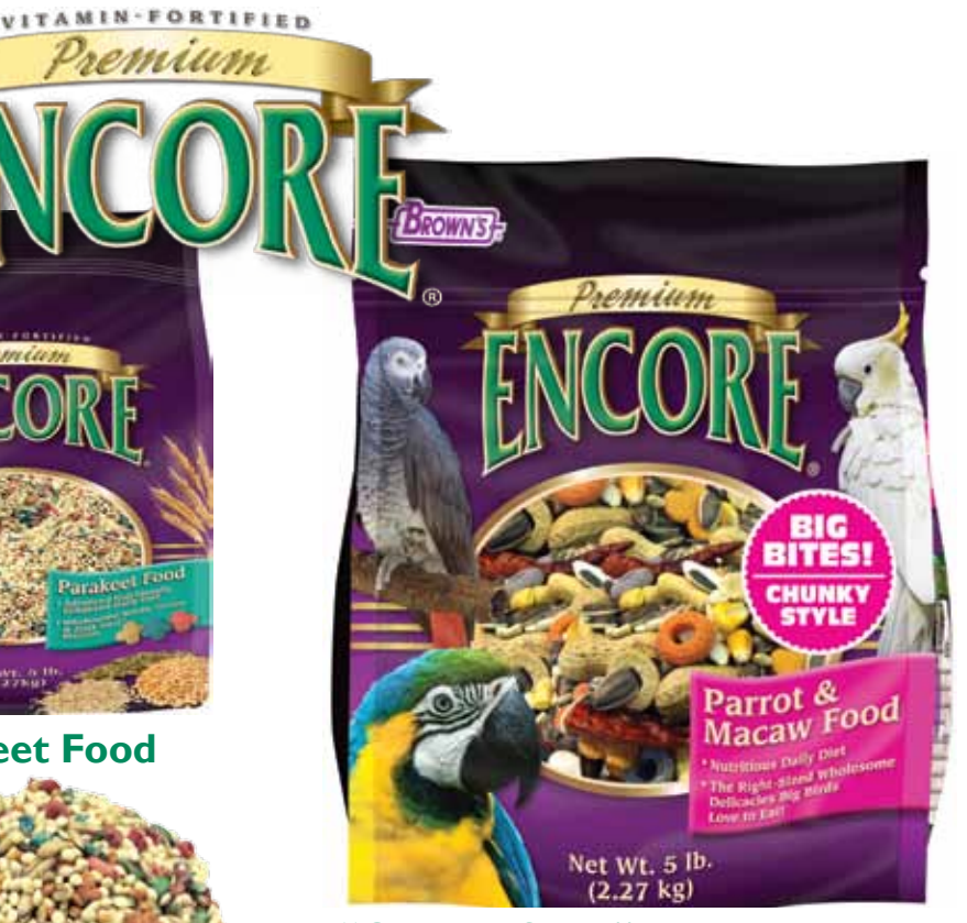
"Chunky Style" Parrot Food