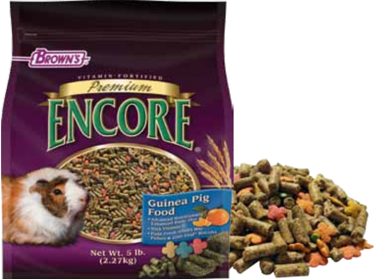
Guinea Pig Food