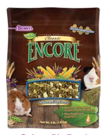
Guinea Pig Food