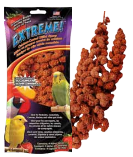
4 ct. Strawberry Recipe Calcium Coated Spray Millet

With thick, rich, energy-boosting honey and natural cuttlebone calcium. It's rich in carbohydrates and protein; a great treat for your pet birds!