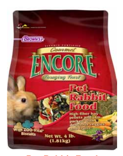
Pet Rabbit Food