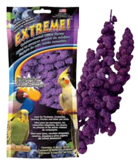
4 ct. Blueberry Recipe Calcium Coated Spray Millet

Brown's® Spray Millet is grown and harvested in the USA. It's an excellent daily treat for domestic pet birds. Birds love spray millet because it's rich in carbohydrates and protein. This highly palatable nutritious treat and supplement can be enjoyed daily! Your birds will find spray millet simply irresistible