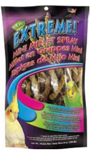
Mini Spray Millet

Millet Spray is a natural and delicious treat. It's fieldfresh and American-grown. All types of pets and wild birds relish our plump, sun-cured millet sprays!