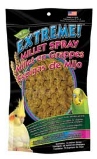
7 oz. Millet Spray

Millet Spray is a natural and delicious treat. It's fieldfresh and American-grown. All types of pets and wild birds relish our plump, sun-cured millet sprays!