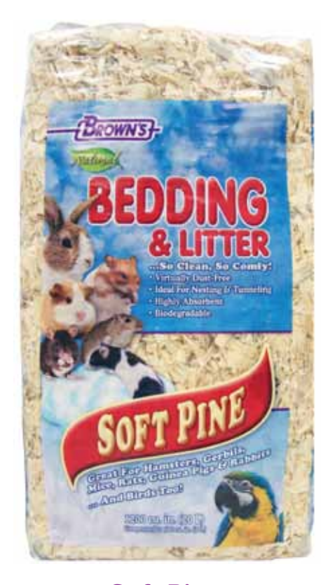
Soft Pine 100% natural, soft & absorbent!

A fresh pine scent for hamsters, gerbils, guinea pigs, rabbits, ferrets, and other small animal habitats.