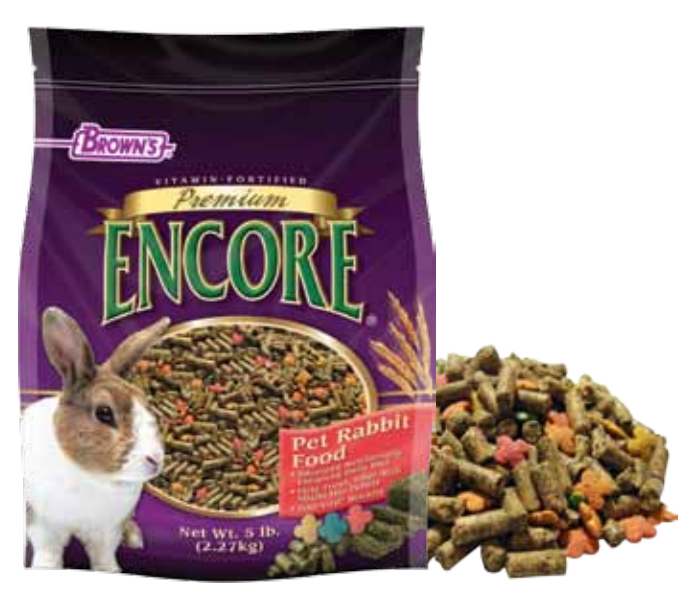
Pet Rabbit Food

Encore® Premium is a nutritionally enhanced daily diet with your companion pet's favorite foods. We use only natural preservatives plus we've added our vitamin-packed Zoo•Vital® biscuits that come in fun shapes, sizes, colors and textures... making this a stimulating diet your pets will simply love!